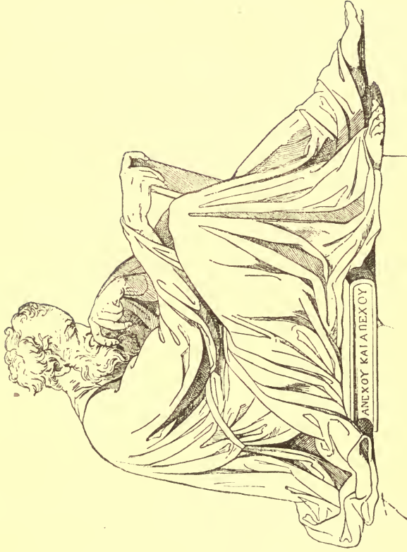
ΕΠΙΚΤΗΤΟΣ, Ο ΔΟΥΛΟΣ.